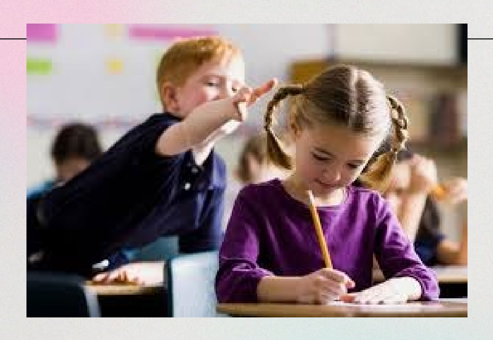
Is the boy showing respect?